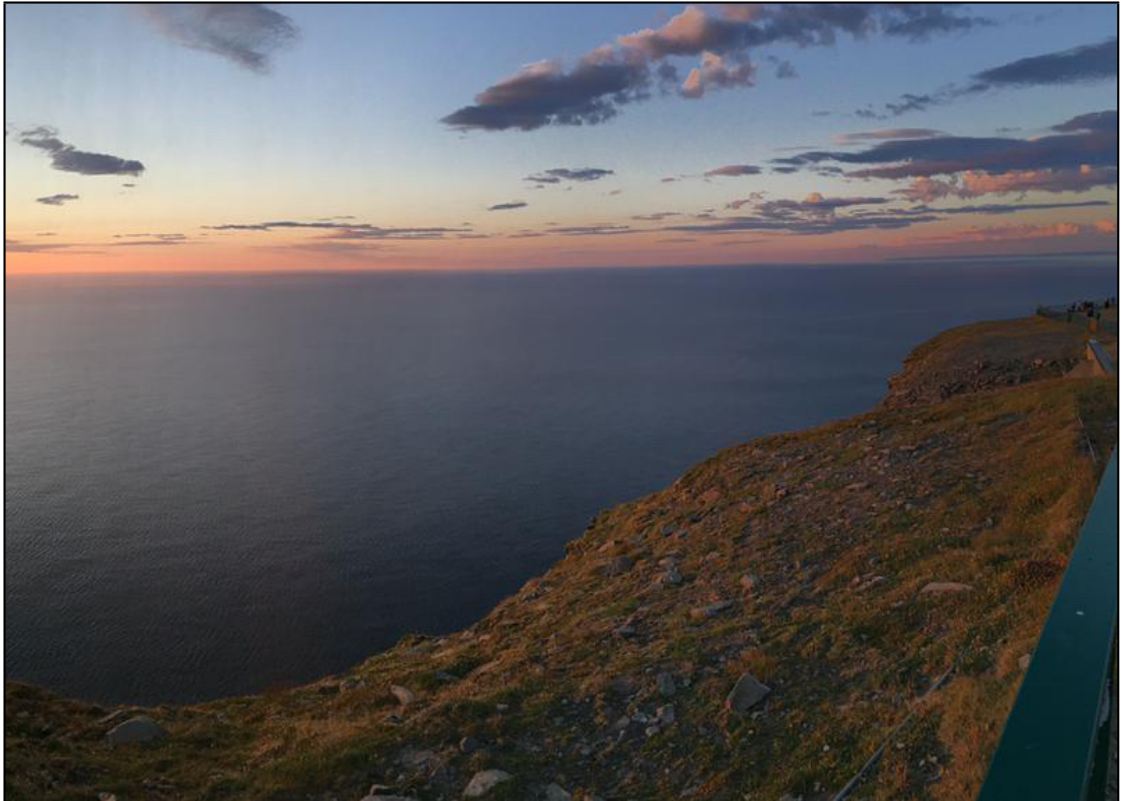
Figure 4: A caption for a double-sided image that will be placed on the right side of the right-hand part of the illustration. The illustration begins on the left edge of the paper. A short form is used for the LOF. The parameter is doublePage

is no need for special content, but the length of words should match the language.