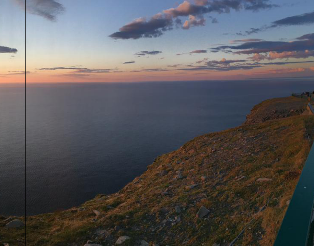
Figure 2: A caption for a double-sided image that will be placed on the right side of the right-hand part of the illustration. The illustration begins on the left edge of the paper. A short form is used for the LOF. The parameter is doublePage

a printed text will look like at this place. If you read this text, you will get no information. Really? Is there no information? Is there a difference between this text and some nonsense like “Huardest gefburn”? Kjift – not at all! A blind text like this gives you information about the selected font, how the letters are written and an impression of the look. This text should contain all letters of the alphabet and it should be written in of the original language. There is no need for special content, but the length of words should match the language.