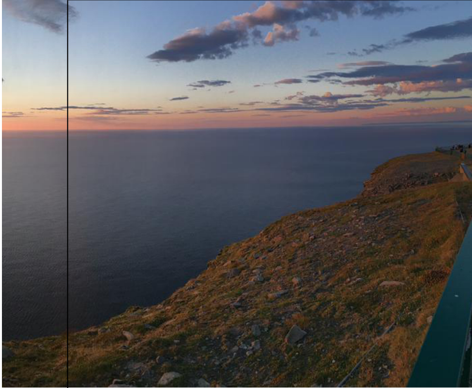
Figure 3: A caption for a double-sided image that will be placed on the right side of the right-hand part of the illustration. The illustration begins on the left edge of the paper. A short form is used for the LOF. The parameter is doublePage

This text should show what a printed text will look like at this place. If you read this text, you will get no information. Really? Is there no information? Is there a difference between this text and some nonsense like “Huardest gefburn”? Kjift – not at all! A blind text like this gives you information about the selected font, how the letters are written and an impression of the look. This text should contain all letters of the alphabet and it should be written in of the original language. There is no need for special content, but the length of words should match the language. Hello, here is the second paragraph. Hello, here is some text without a meaning. This text should show what a printed text will look like at this place. If you read this text, you will get no information. Really? Is there no information? Is there a difference between this text and some nonsense like “Huardest gefburn”? Kjift – not at